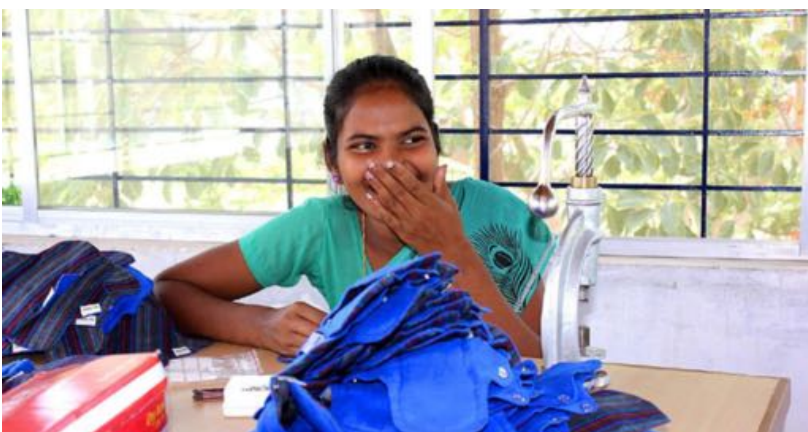
Buttoning the pads at Auroville Village Action Group (AVAG)